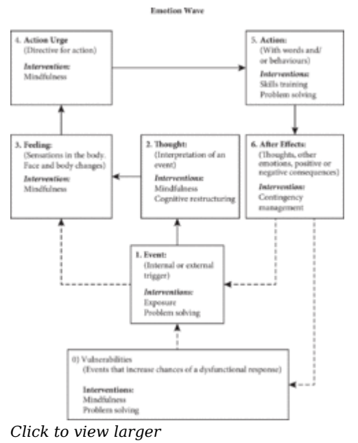
Figure 2. Emotions Wave and targets for intervention.

after-effects or consequences of an action (e.g., being rewarded or punished, other thoughts or emotions) are targeted through implementing and teaching contingency management procedures.